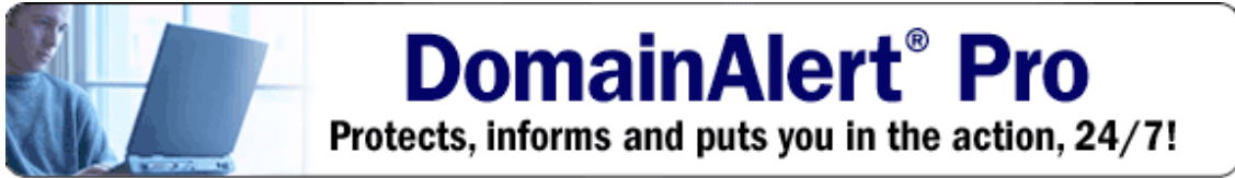
Figure 1 – DomainAlert product page