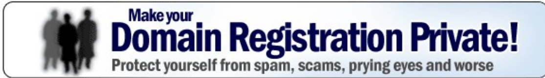
Figure 1 – Private Domain Registration landing page